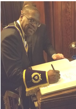
Signing the Great Book

A detailed report will be presented in my Grand Masters Address.