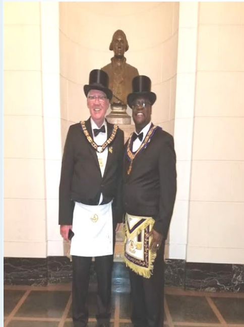
HIGHLAND LODGE #86 VISITATION DENVER COLORADO