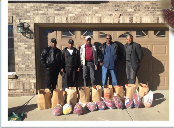
Members of Rocky Mountain Lodge #1 prepared baskets for 51 families