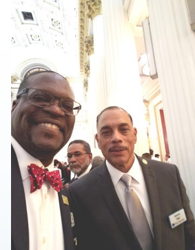
MWGM PHA of Nevada