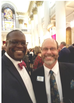
MWGM Utah AF&AM