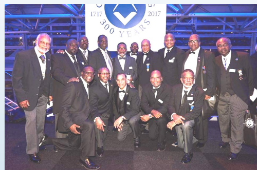
MWPHGMs in attendance to 300 year celebration