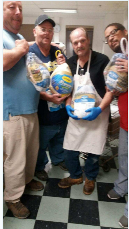
Members of Pikes Peak #5