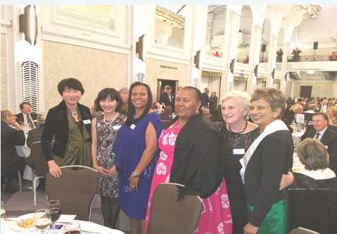
First Ladies Japan, China, Colorado PHA, Bahamas PHA, and England