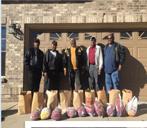
Members of Mount Evans #7 prepare Thanksgiving Baskets for their widows