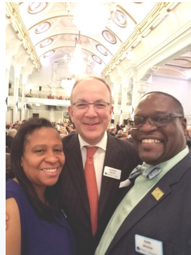
DGM of UGLE