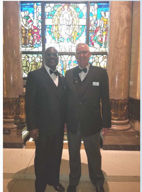
UNITED GRAND LODGE OF ENGLAND 300 YEAR CELEBRATION