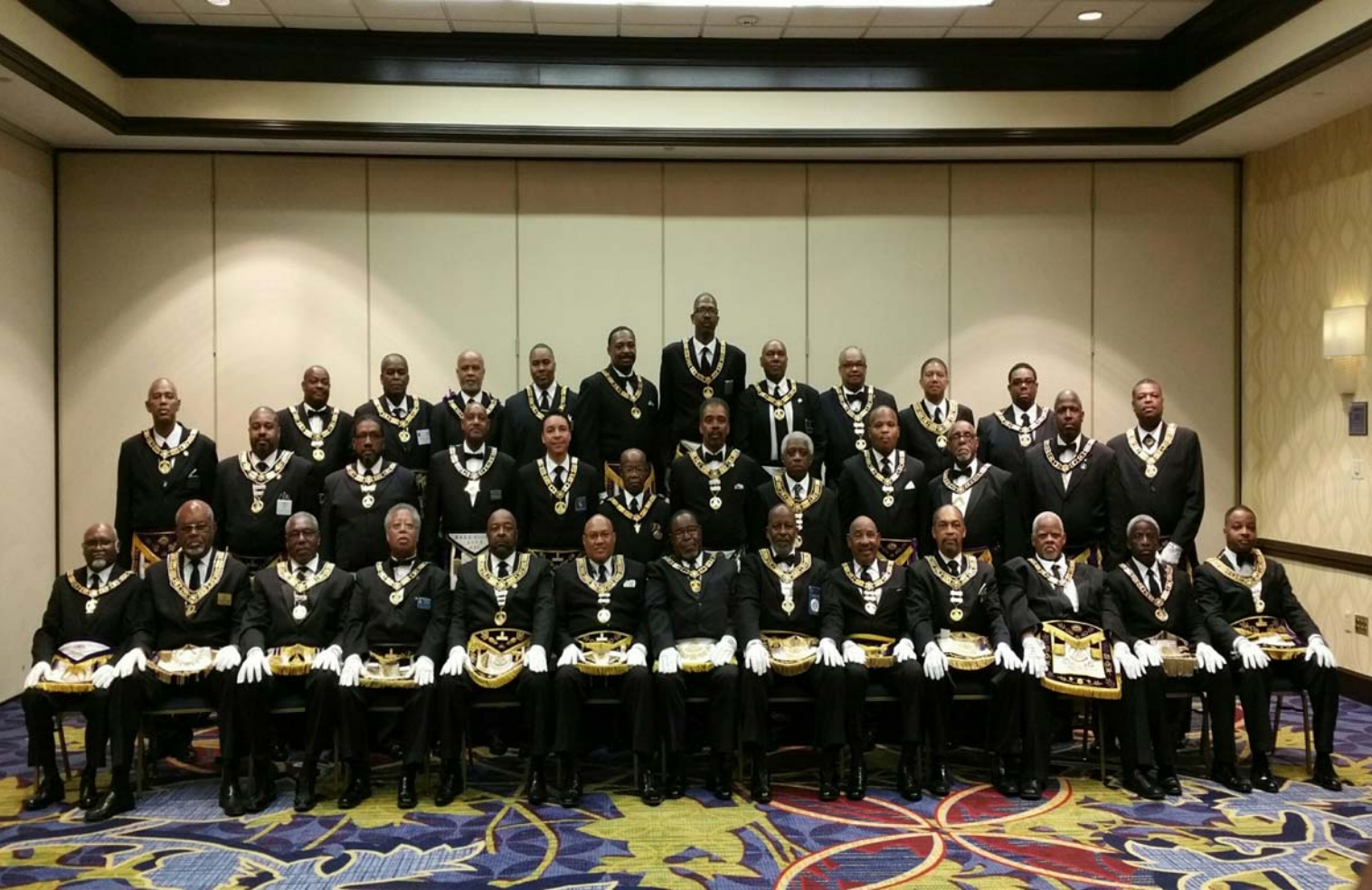
COGM (Above) USC (Below)